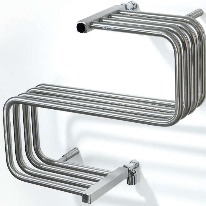
510 x 585 in brushed finish shown with Tempo valves