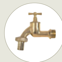
For suitable taps and accessories, see page 30